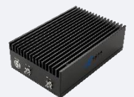
Available 220V System Benchtop Amplifier